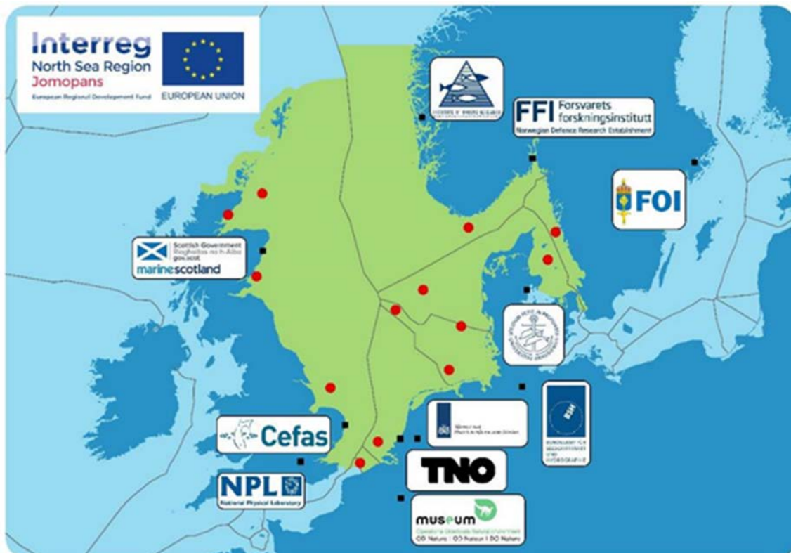
Fig. 1: JOMOPANS monitoring stations (red dots) and project partners.

This project will deliver a combination of modelling and high quality measurements at sea for an operational joint monitoring programme for ambient noise in the North Sea. The use of consistent measurement standards and interpretation tools will enable marine managers, planners and other stakeholders internationally to identify, for the first time, where noise may adversely affect the North Sea. The project will explore the effectiveness of various options for reducing these environmental impacts through coordinated management measures across the North Sea basin. Figure 1 shows the location of the 14 JOMOPANS monitoring stations and the partners on the project.