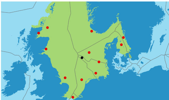
Figure 1. Map of North Sea with 14 stations which up to June 2019, 13 (red dots) are active.