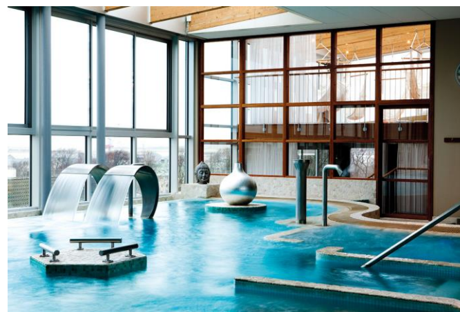
Spa of Varberg