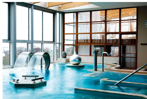
Spa of Varberg