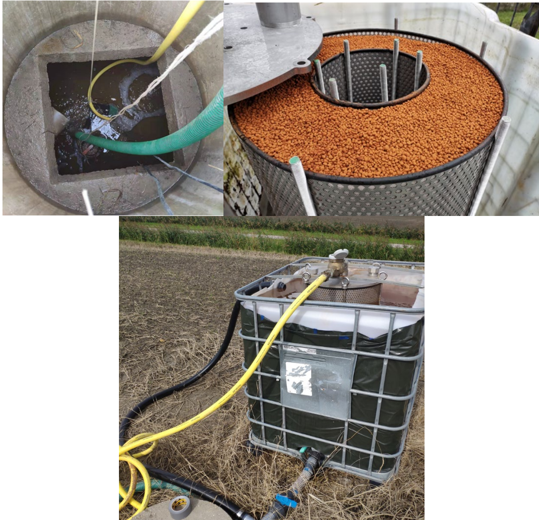
Figure 3. The upscaled P filter in Middelkerke