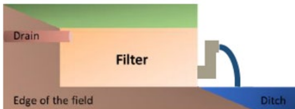
Figure 2. Schematic overview of the installation of P filters at individual drainage tubes in the field

P concentrations in the drainage water are too high (on average 0.47 mg TP/l and 0.37 mg DRP/l) to meet the EU standard in the receiving surface water. The basic concept to reduce these P losses is installing a filter box containing a P sorbing material (PSM) at the end of the drainage tubes. This forces the water through the filter material and allows the removal of P from it before entering the ditch (Figure 2). We have developed filter boxes that have been installed at the end of single drainage tubes. This design works well for the typical discharge of individual drainage tubes, but needed to be upscaled to also efficiently treat larger volumes of water as in the case for collector drains.