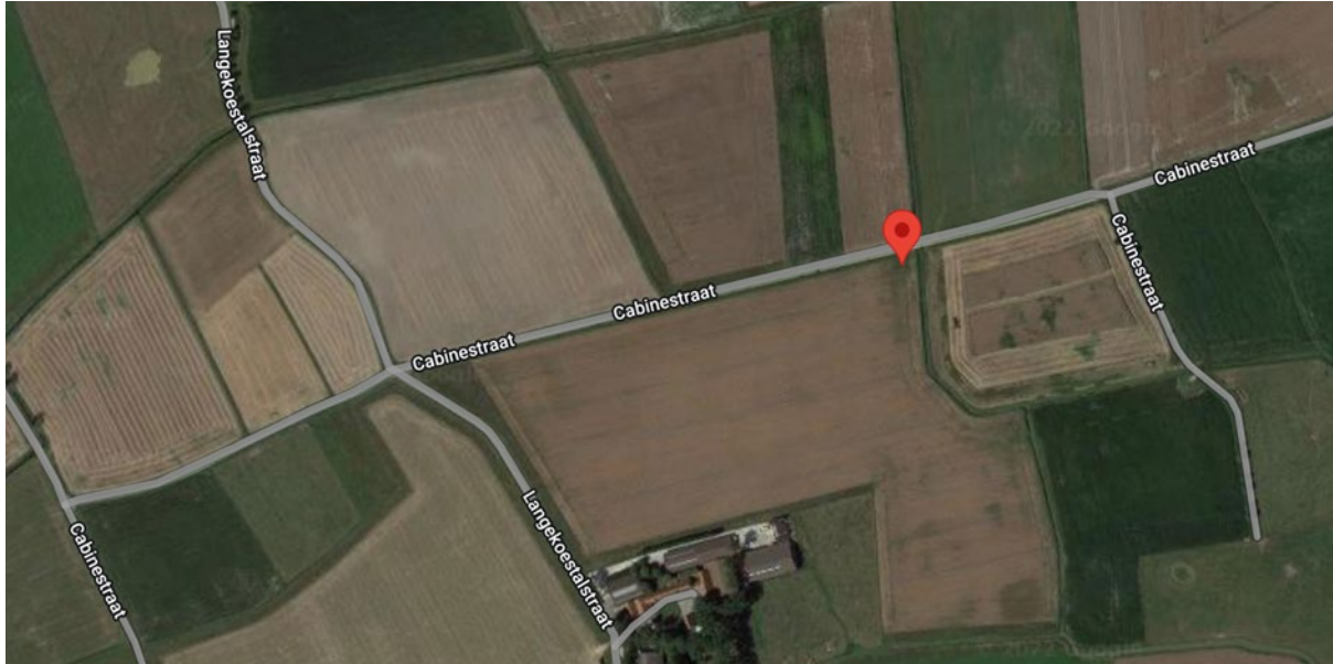
Figure 1. Location of the site at Middelkerke