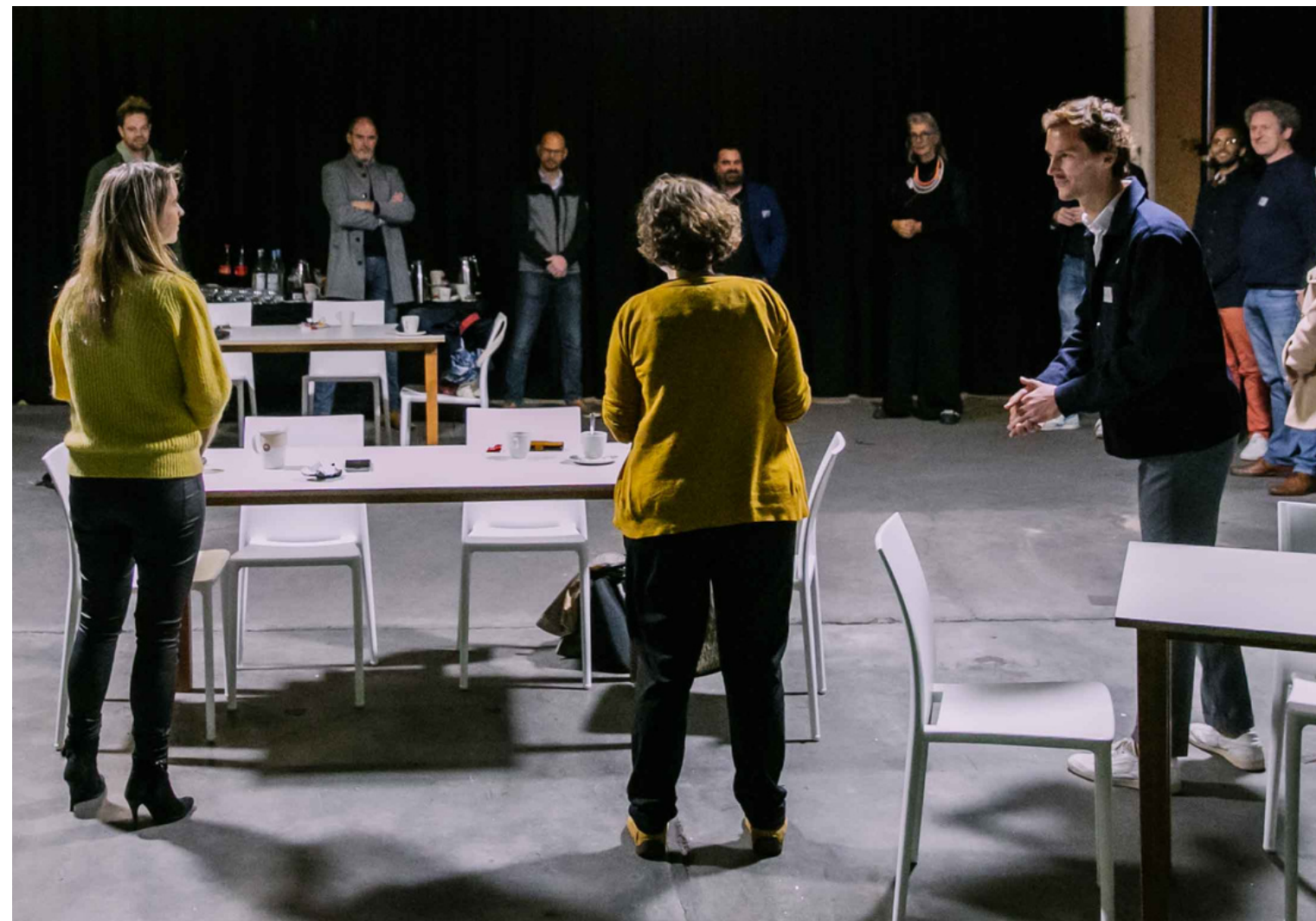
Creativity Summit 2021, Kortrijk