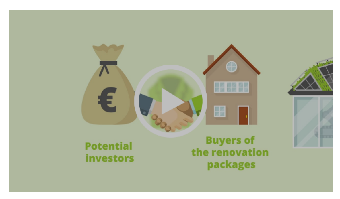
INDU-ZERO presents the concept of Smart Renovation Factory.

Watch this explainer video to see how INDU-ZERO intends to fast-track the energy renovation of 22 million houses in the North Sea Region by blueprinting specialised factories.