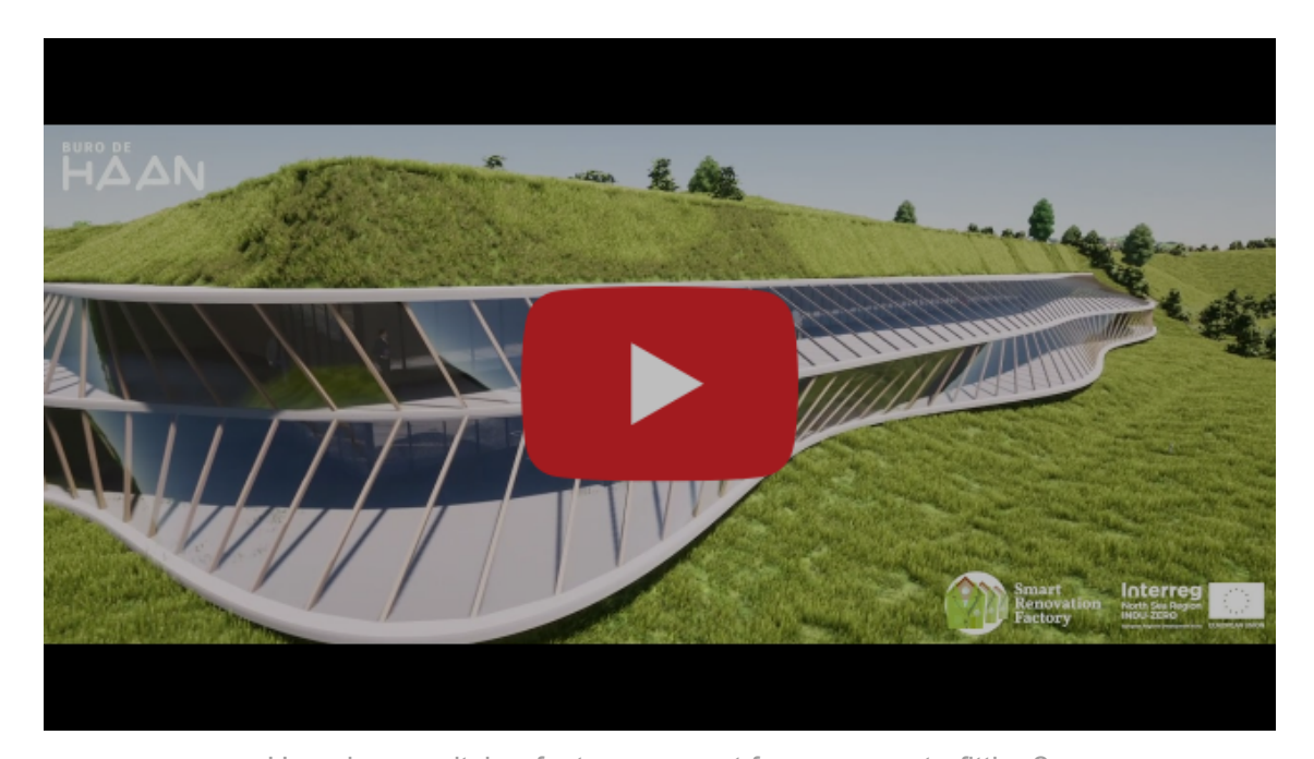
How do you pitch a factory concept for energy retrofitting? Watch this stunning video made by INDU-ZERO!