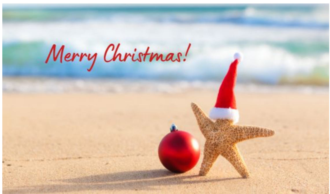
Our office is closed for holiday until 3 January. We look forward to being in touch again in the New Year!

In Norway, they hide all broomsticks on Christmas Eve before going to bed. Why? Because the witches are out that night and might steal them!