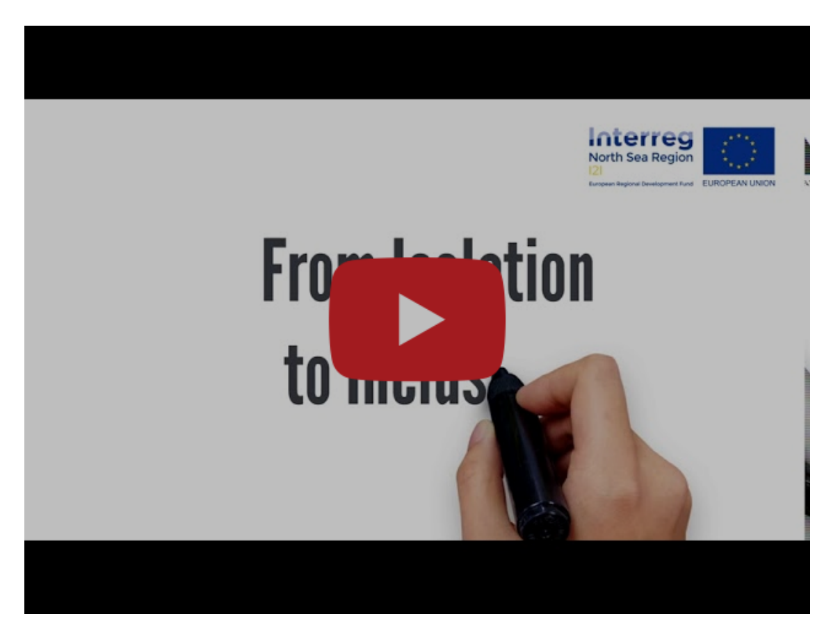
Are you lonesome tonight? Then you are not alone! Loneliness affects too many people's lives and health. We are very proud that I2I is doing something about that.