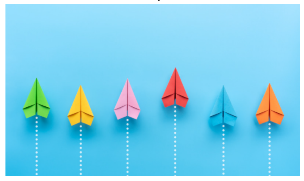
Call 1: First round of applications are in!

The first of two deadlines in Call 1 of the future Interreg North Sea Programme has now passed. Here are the numbers. > Learn more