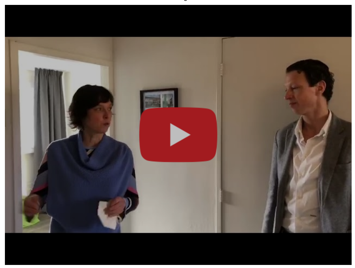
How do you energy renovate 22 million homes at half the normal cost? INDU-ZERO has an answer. Come with them on a delightful1-minute walk in a demo house!