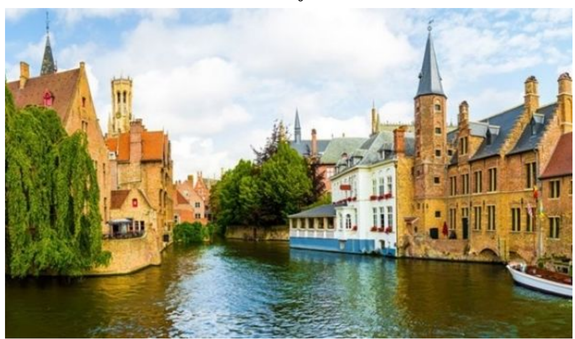
All aboard! Register for the North Sea Conference

Registration is open and the events are filling up fast! Hurry up to join us for three days packed with exciting content and networking opportunities. > Learn more