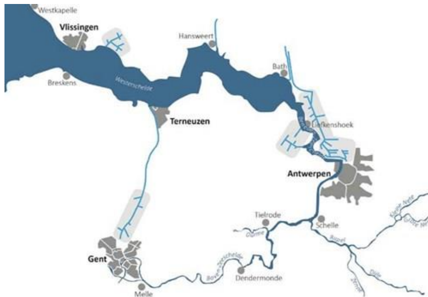
Source: Report 'Systeemanalyse Natuur schelde-estuarium' (Illustrations by Zuidhof A., rvo.nl)

In the Flemish Lower Sea Scheldt sandy material is currently dredged from the sills of the fairway and transported to the relocation site 'Schaar van Ouden Doel'. This submerged relocation site is protected from high water current velocities by a dam. The capacity of the site is maintained by allowing commercial sand extraction in a similar volume as the annual volume of sand that is brought in from dredging activities.