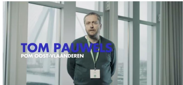
Picture: Rotterdam. Maritime capital of Europe.