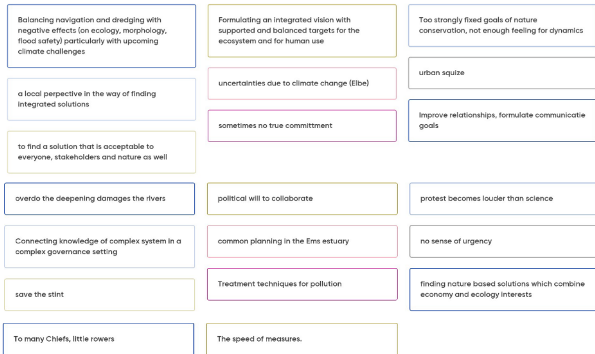
Figure 3. Participant responses on personal concerns in estuary management