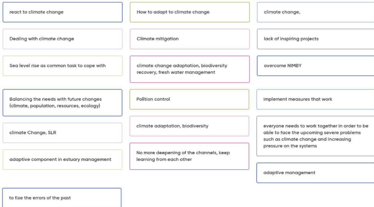
Figure 5. Participant responses on future challenges in estuary governance