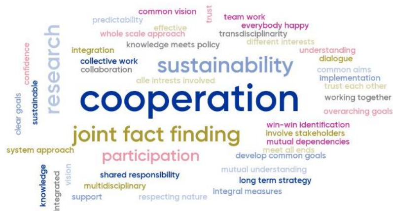
Figure 1. Word Cloud response to opening question on successful estuary governance