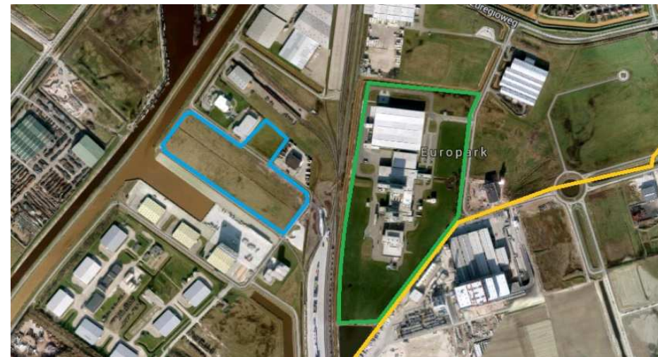
Map of Europark (R.E.M. and Iams Europe BV)