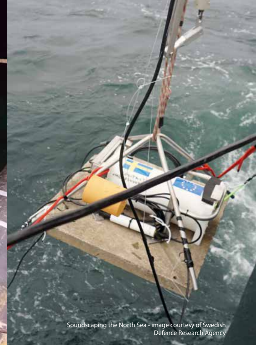
Soundscaping the North Sea