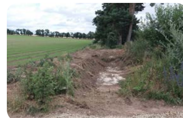
Figure 4. Track grip directing run-off into a silt trap