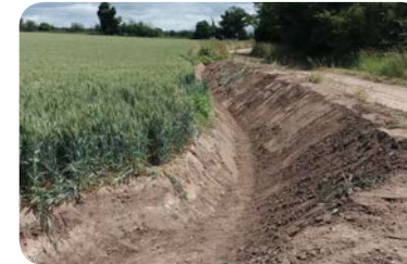
Figure 3. Corner silt trap along field edge