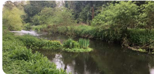
Figure 1. The River Lark

The traps are maintained by removing the accumulated sediments and any attached nutrients. This can then be returned to the field where it will benefit the farm.